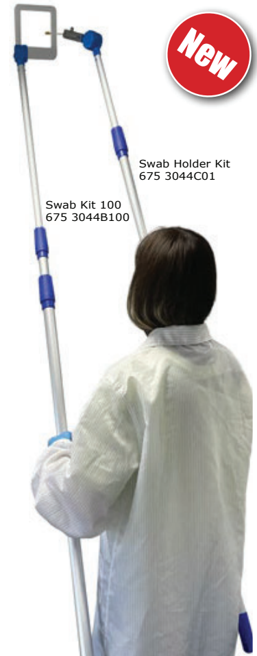
Swab Holder Kit 675 3044C01

Note: Swabs are not included with the Swab Holder Kit.