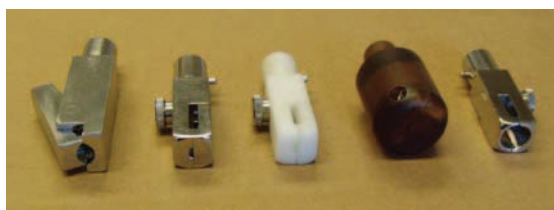
A B C D E