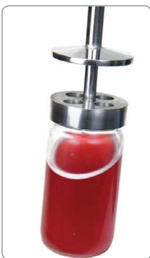
Bottle Sampler without Bottle Cover