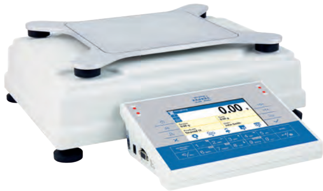
PM C32, d = 0.01 g

'Advanced level' measurement of large masses with the highest accuracy in laboratory and industry