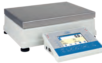
PM C32, d = 0.1 g