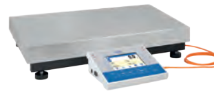
PM C32: d = 0.5 g, d = 1 g