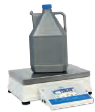
Weighing heavy loads with the maximum accuracy