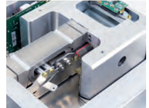
Radwag MonoBLOCK™, an innovative weighing system